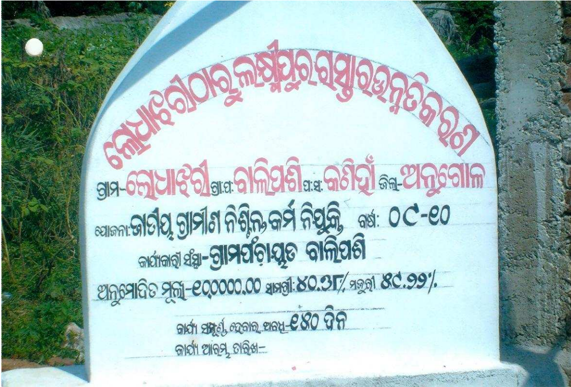
DISPLAY BOARD OF LODHAJHARI TO LAXMIPUR ROAD