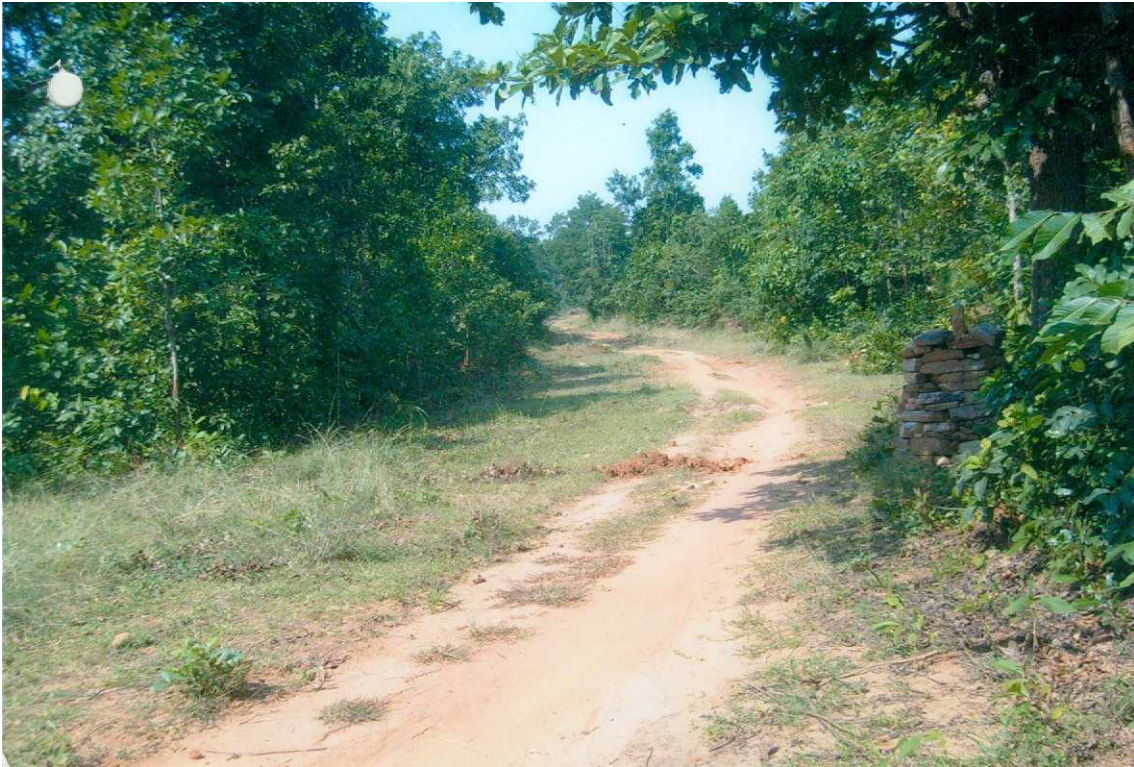
LODHAJHARI TO LAXMIPUR ROAD BEFORE EXECUTION