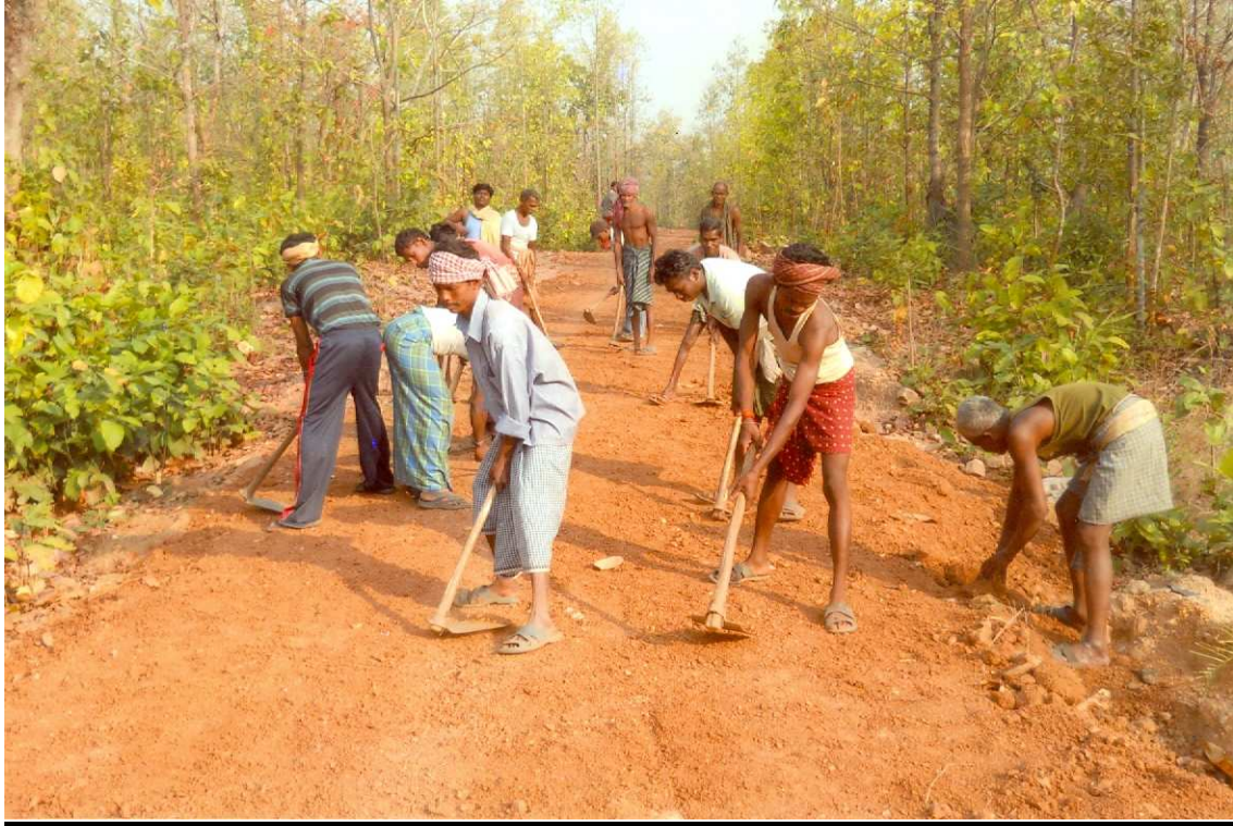
LODHAJHARI TO LAXMIPUR ROAD DURING EXECUTION